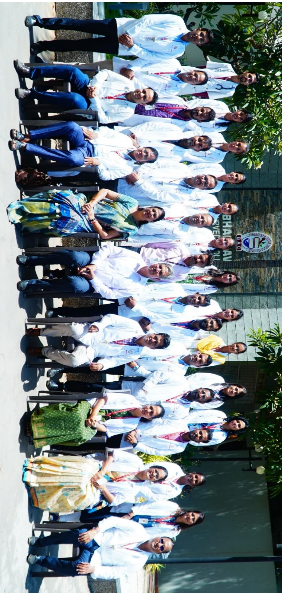
NCISM Bhargava Ayurveda College Visitation photo - 20/04/2023