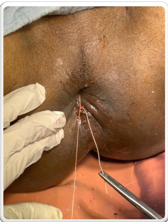
Ksharsutra ligation (seton) done under Local Anaesthesia Fistula in ano.