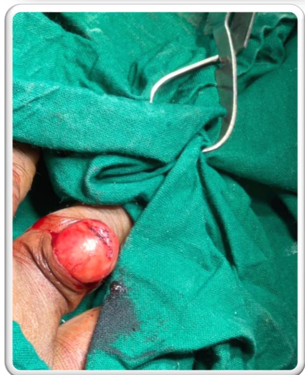
Dermoid Cyst Excision