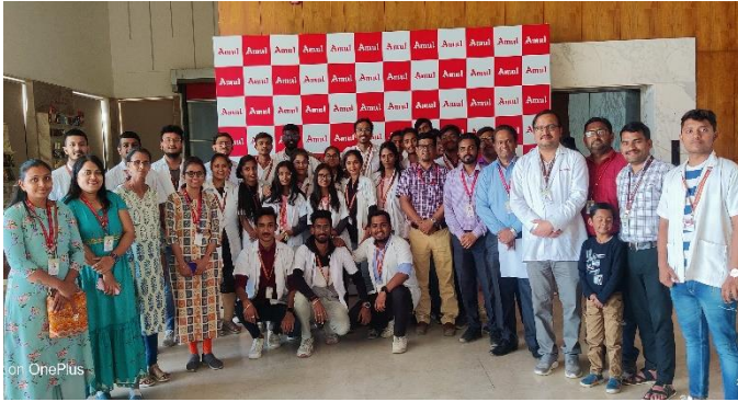
Amul Chocolate Visit 6 th Feb 2023

academic curriculum. 34 students of 3 rd year were visited.