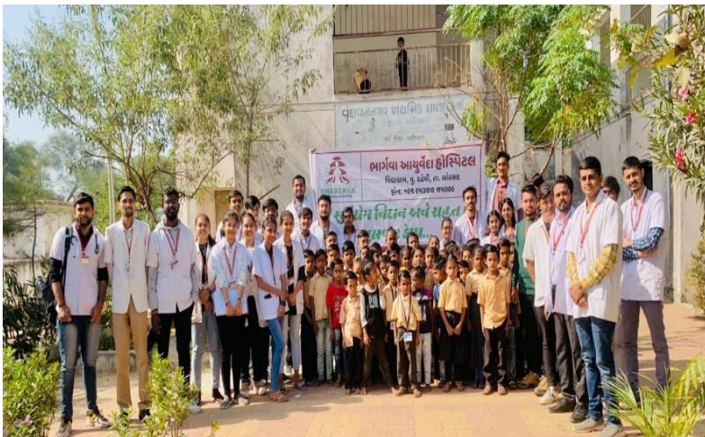
सुवर्णप्राशन Camp-Balrog Dept.(4 th Jan 2023)