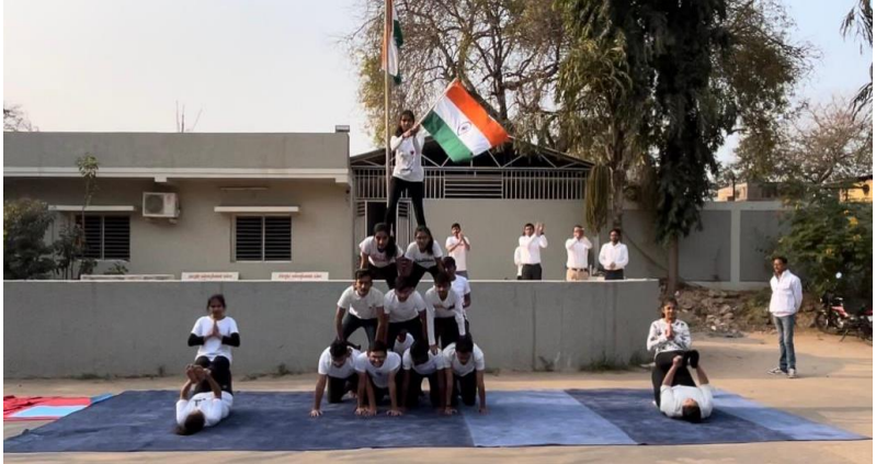
Intense stretches and flanks on 26 th Jan 2023