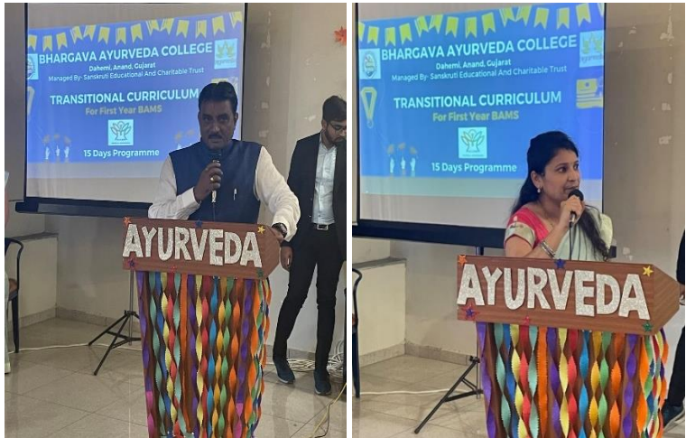
Transitional curriculum Program (20 th feb 2023)