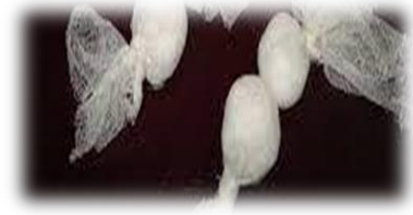
Sterile Gauze Piece