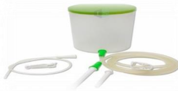
Enema Pot with Plastic Nozzle