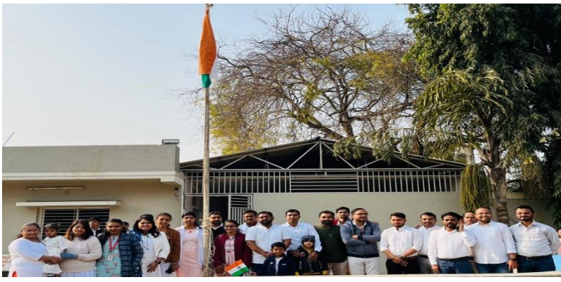
26 TH Jan Flag hosting ceremony