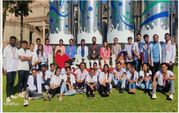
Amul Dairy Visit 7 th Feb 2023